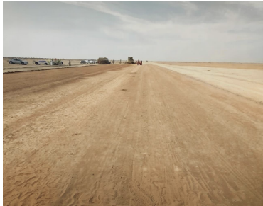
Saudi Arabia — C-130 Airstrip DoD / Military Aviation

T-PRO® has been deployed on 4 continents — from desert military airstrips, island roads, and Canadian haul roads.