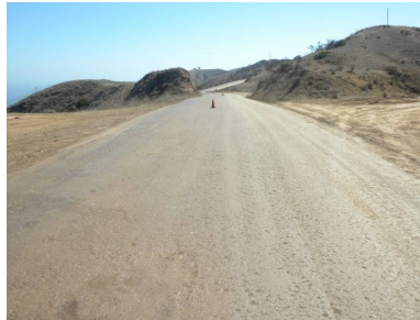
Santa Catalina Island, CA Road Reclamation & Stabilization