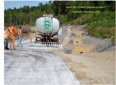
Centre Port, Manitoba Municipal Dust Control