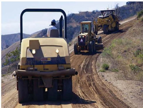
T-PRO® application — Full Depth Reclamation